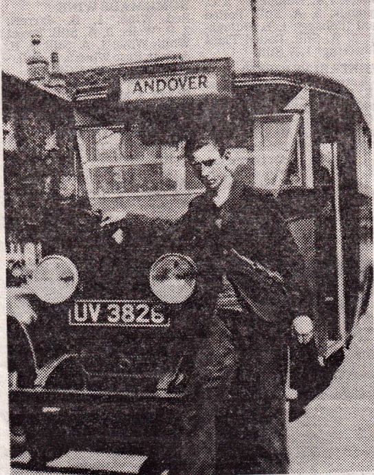
Rural transport at Broughton. An Andover bus waits at Broughton.