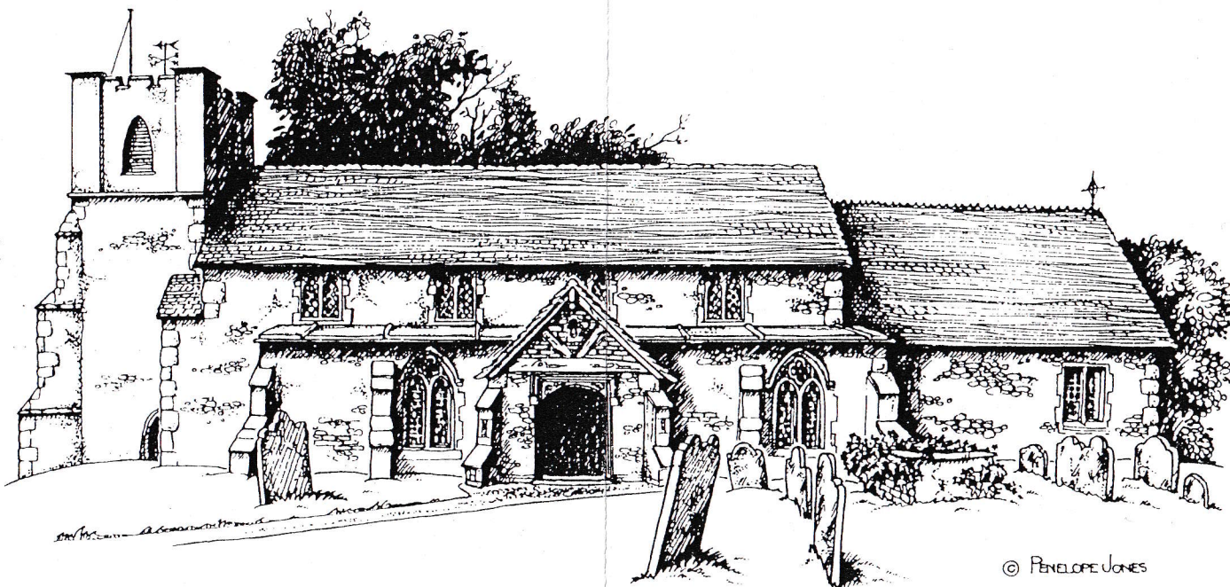
St. Mary's Church, Broughton, Hampshire