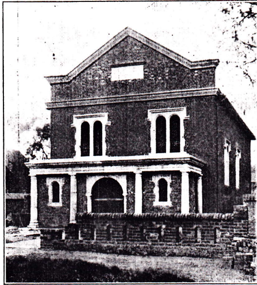
Alterations nearing completion.