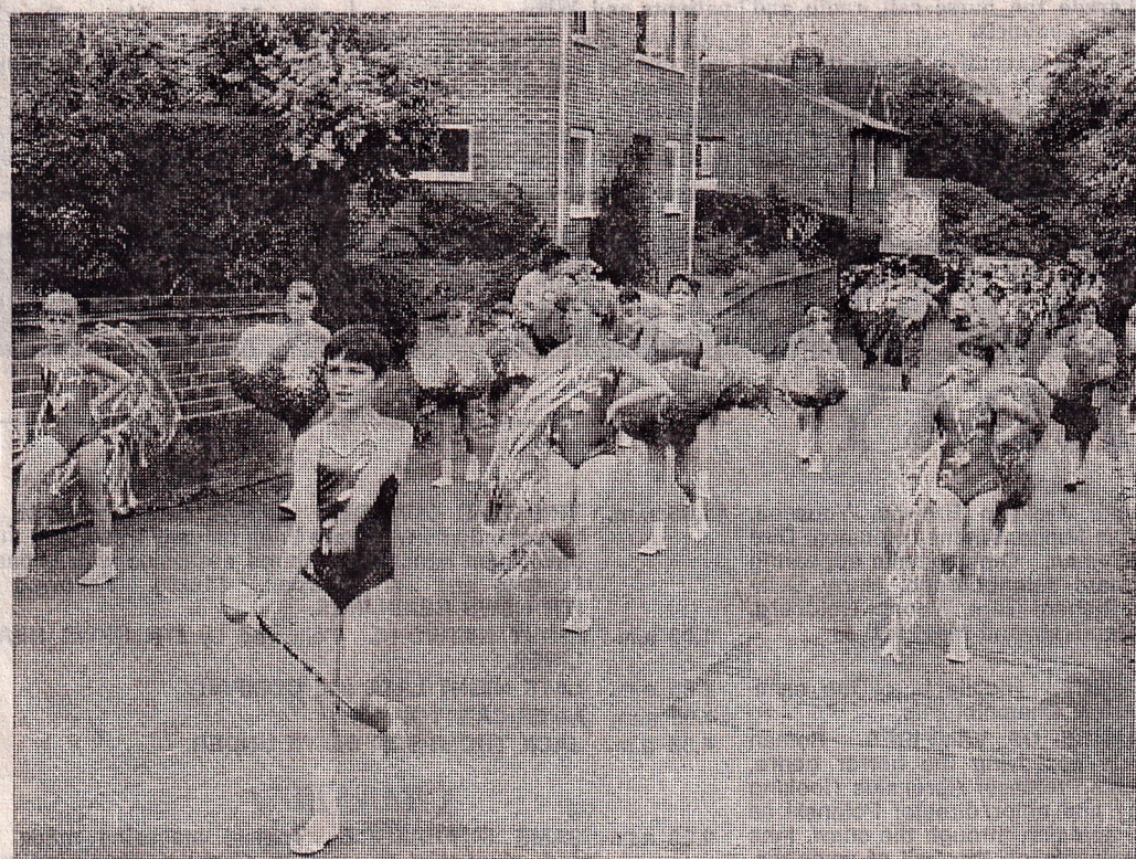
Give us a whirl! Majorettes and the pom pom troop march through Broughton during the village's annual fair

The Fair was organised by the Broughton General Fund and profits will go towards providing new equipment for the children's playground.