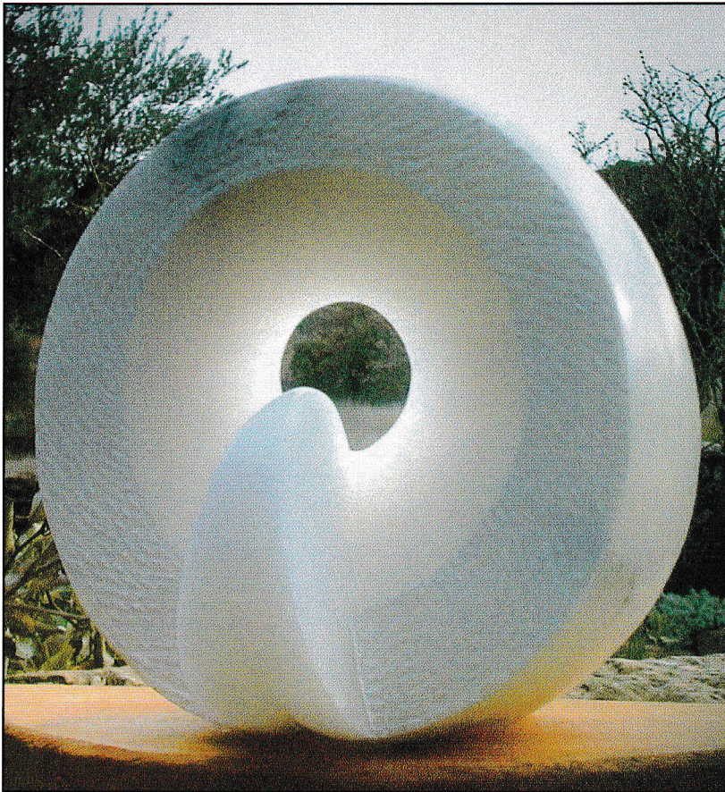
▲ MOON CIRCLES by Celia Lindsell (Alabaster)