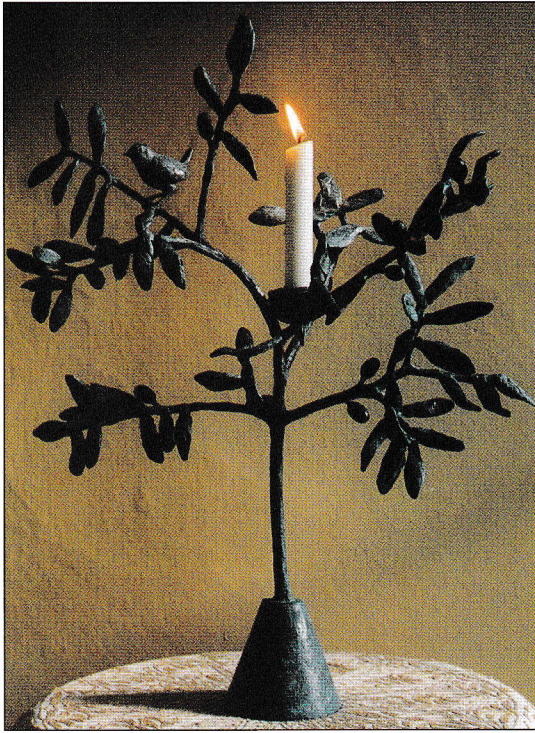
◀ LE TEMPS DES OLIVES by Zoé de L'Isle Whittier (Bronze)

• Sculpture • Pots • • Mosaics • Candleholders • Mirrors • and more, for gardens and conservatories.