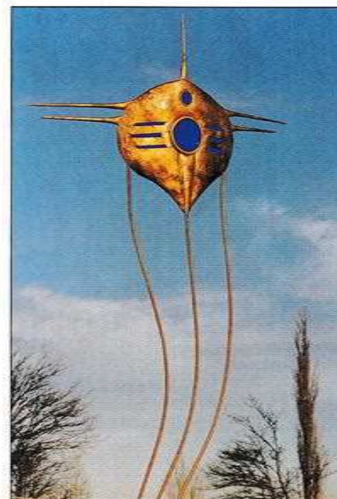
◀ CELESTIAL SPIRIT I by Peter Clarke (Copper, steel, stained glass)