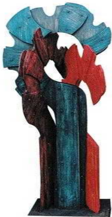
▲ AZTEC by Antonia Spowers (Pine on oak base)