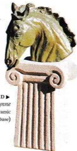
▶ HORSE HEAD by Althea Wynne (Bronze on ceramic base)